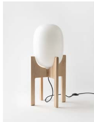
Clore Floor Lamp