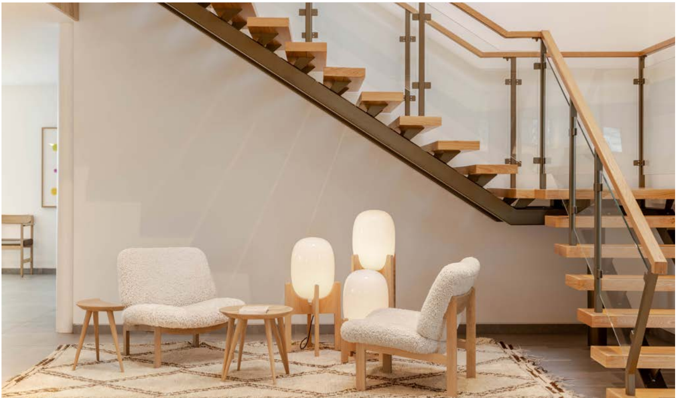
Tamart furniture specified for Maggie's cancer centre, Wales, UK