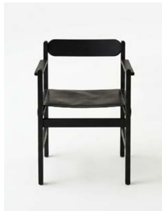
Highgate Chair with Arms