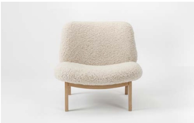
Clore Lounge Chair